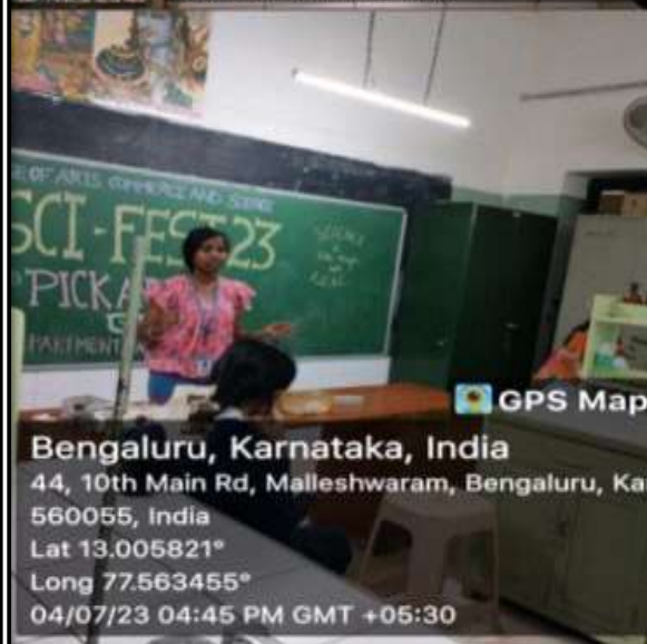
Bengaluru, Karnataka, India 44, 10th Main Rd, Mallechwaram, Bengaluru, Karnataka 560055, India Lat 13.005821° Long 77.563455° 04/07/23 04:45 PM GMT +05:30