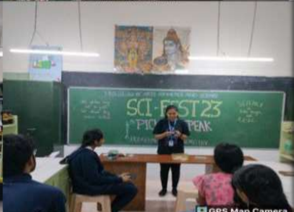
Bengaluru, Karnataka, India 46, 15th Cross Rd, Mallechwaram, Bengaluru, Karnataka 560003, India Lat 13.005463° Long 77.56342° 04/07/23 04:41 PM GMT +05:30