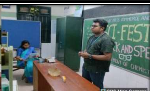
Bengaluru, Karnataka, India 46, 15th Cross Rd, Mallechwaram, Bengaluru, Karnataka 560003, India