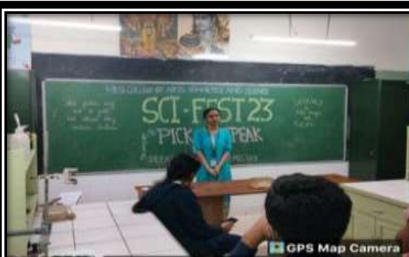
Bengaluru, Karnataka, India 46, 15th Cross Rd, Mallechwaram, Bengaluru, Karnataka 560003, India Lat 13.005496°