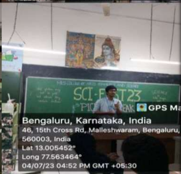
Bengaluru, Karnataka, India 46, 15th Cross Rd, Mallechwaram, Bengaluru, Karnataka 560003, India Lat 13.005452° Long 77.563464° 04/07/23 04:52 PM GMT +05:30