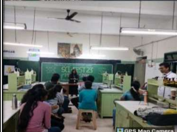
Bengaluru, Karnataka, India 46, 15th Cross Rd, Mallechwaram, Bengaluru, Karnataka 560003, India Lat 13.005556° Long 77.563457° 04/07/23 04:56 PM GMT +05:30